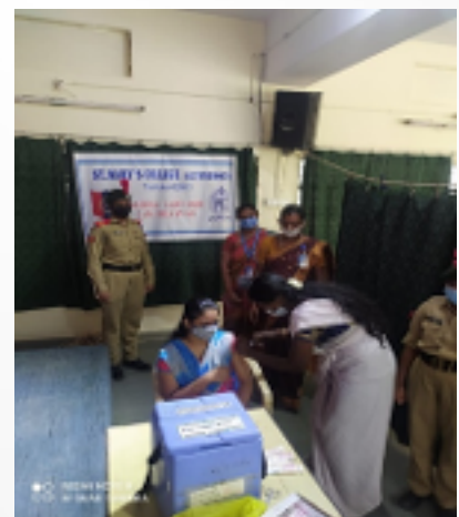
COVID-19 Vaccine Drive